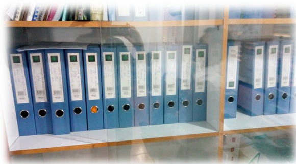
Example of Teacher Profiles organized into box files for each teacher

Teachers should be conscious of their achievement and development over the length of their careers. To help teachers to develop such a consciousness, each teacher should be assisted with developing a Professional Profile that documents how they have improved themselves over the years. The file may also include correspondence between the school and the teacher regarding their professional development, as well. Accordingly, each New Generation School should establish and maintain a profile for each teacher posted at the school, which should be periodically updated by both School Managers and the Mentor in collaboration with the teacher. The following documents may be included in the teacher profile: