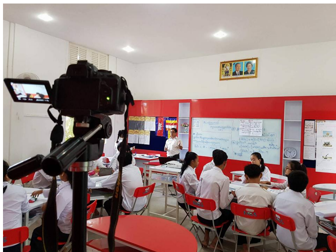
A Khmer language teacher videotapes his lesson to help him get an outside perspective when assessing his lesson.

The self-assessment of the class may be done in several ways. For example, a teacher may opt to videotape herself and then provide a critique of the lesson on the basis of the video; alternatively, the assessment can also take the form of a team teaching exercise in which the Mentor teaches the lesson with the teacher to achieve a particular goal. The assessment may also take the form of a more conventional observation but where the teacher and Mentor complete the observation form together, trying to reach a consensus on strengths and weaknesses. Whatever form the self-assessment takes, it should be carefully planned beforehand by both the teacher and the Mentor during the Individualized Conference.