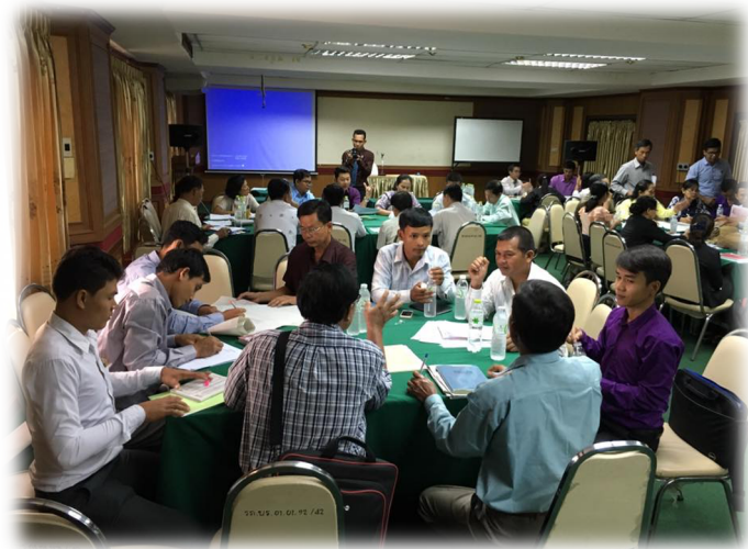
Reflection Exercise: Cambodian Educators attend a reflection meeting at a school in Thailand

Depending on the availability of funding, school mentors should also plan on bringing teachers to visit schools with very high standards either in Cambodia or abroad. The NGS Network will provide a listing of such schools where there have been positive learning experiences as well as willingness to receive visiting schools. Study Trip experiences are very useful because they provide exposure to new ideas, high professional standards, and different ways of organizing schools and classrooms. The exposure visits should be well planned with pre-visit discussions among teachers, school managers, and Mentors occurring beforehand to set out the objectives of the visit and how these might relate to efforts to further improve the school. There are also provisions in the Career Path Planning form to help teachers to think through the objectives of a study visit and how such a visit might help to achieve professional goals that they have set for the year.