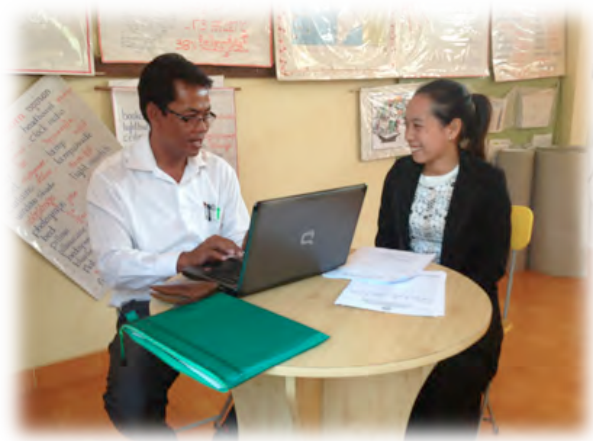
Teacher conference to follow up on career path planning and reflection logbooks

Mentors should plan at least two individualized conferences with teachers during the school year (preferably more) in order to plan technical support to the teacher to