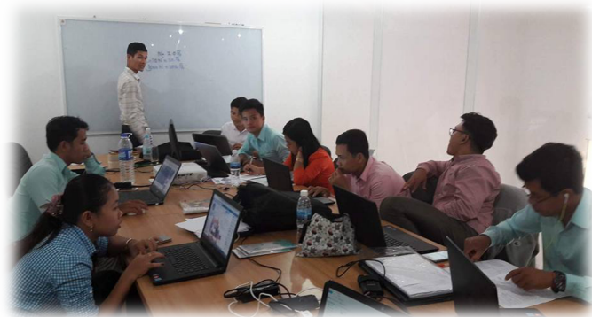
Math Teachers hold their regular weekly meeting to discuss the lessons for the upcoming week.

The New Generation School recognizes that in order for a school-based teacher development program to be successful, there must be a strong culture of professional behavior at the school. The majority of teachers must be both committed and motivated to strive for excellence. There should be behavioral norms in place whereby teachers who come late, extort money from students, and show poor preparation will meet with disapproval from their peers. These behaviors should be the exception, not the norm as it is at many public schools. When the majority of teachers are committed to a higher standard of performance, they will reinforce each other and dis-incentivize dysfunctional behaviors. Thus, it is essential for every New Generation School to take active steps to create a Professional Learning Community where teachers support each other, share information, and enforce positive behavioral norms. Here are some important measures that should be put in place to ensure an active PLC at any given school: