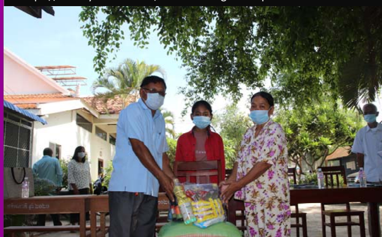
Survival student during Covid-19 pandemic https://www.youtube.com/watch?v=UvgLhRRaqh0&t=21s