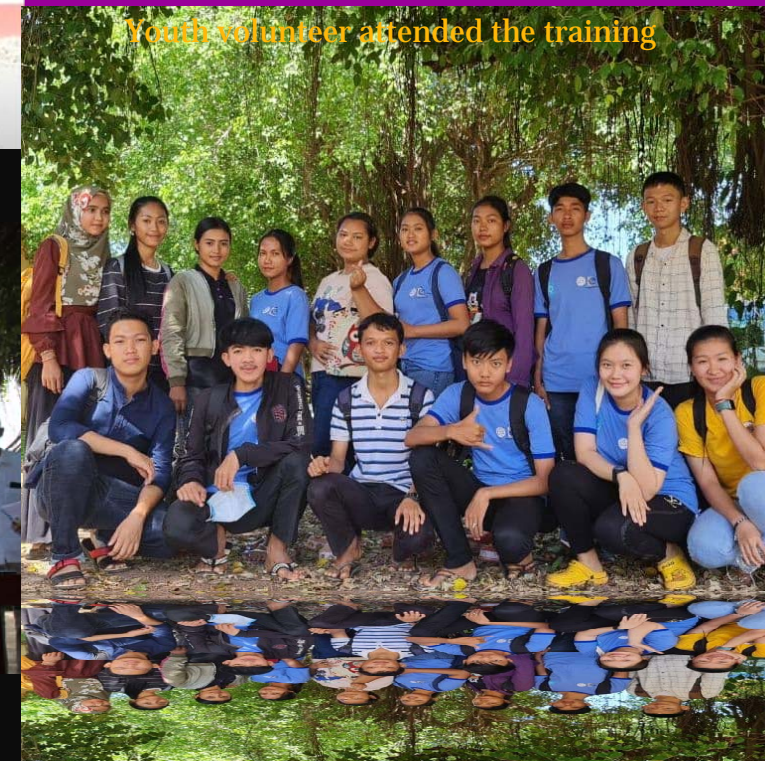
Youth volunteer attended the training