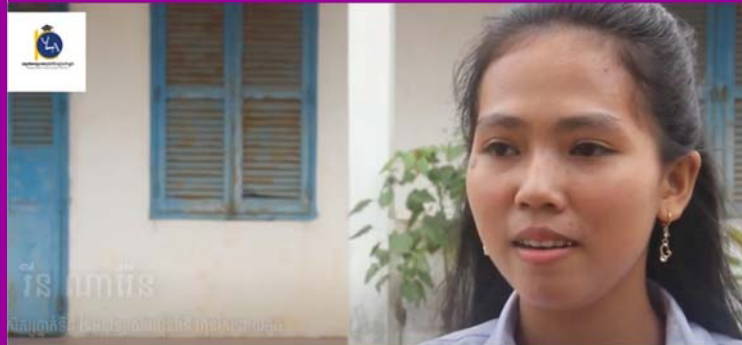
Benefit when we attended the KYLA project: https://www.youtube.com/watch?v=ecUvnzjH2Hc&t=1s