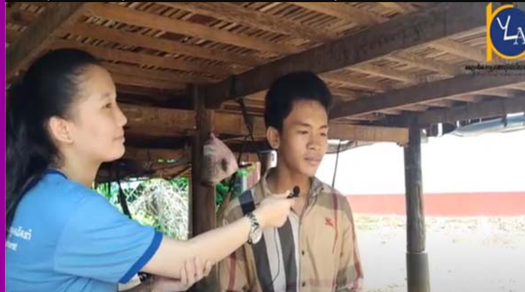
Survival student during Covid-19 pandemic https://www.youtube.com/watch?v=UvgLhRRaqh0