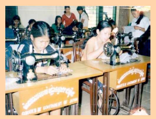
Sewing is a very traditional skill for Cambodian women but remains popular with both young and old