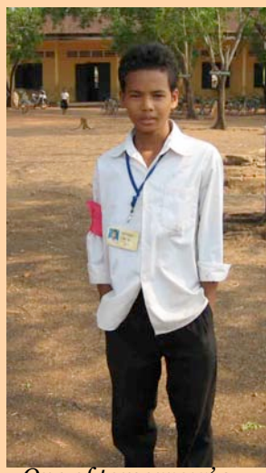
One of tomorrow's leaders

Kranhyoung Primary School is located in Ponyea Krek District. In a survey conducted by KAPE in 2001, the survey team concluded that the school appeared to be a hopeless example of bad school management with barren school grounds, litter everywhere, and filthy classrooms. When the ES-CUP program began in 2005, the old school director retired and was replaced by a teacher who had been promoted through the ranks. The new director has seized on the idea of Student Associations as a means to increase local ownership of the school. With support from ESCUP, he has done a remarkable job in transforming the school, both inside and out, by using the