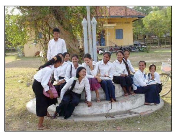
<u>Uncertain Futures</u>: Scholarship beneficiaries at a lower secondary school, 2007

At upper secondary school level, another cohort of girls completed the secondary education cycle. Of those starting in the program in 2001, 20% made it through to Grade 12. This compares with a completion rate of 17% for an earlier cohort the year before. Dropout across all cohorts in Grades 10 to 12 was only 6%, down from 19% in the previous year. Failure rate among beneficiaries was 8% but 29% among those taking the nationally set Bac Double Examination failed whereas last year all those that took the examination had passed. GPI changes in enrolment are encouraging with an average GPI of 0.85 at Grade 10 (up from 0.56), 0.75 at Grade 11 (up from 0.56) and 0.72 at Grade 12 (up from 0.45).